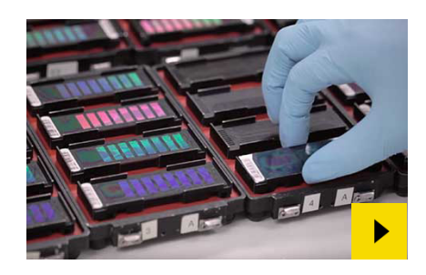
Pfizer Partnerships: Technology

Our collaboration with 23andMe, Inc., a leading personal genetics company, enables us to study demographic and phenotypic data from nearly a million genotyped, de-identified individuals who have consented to participate in genetic research. Through this robust collaboration, we have been able to explore the links between genetic variation and disease phenotypes to identify new targets of potential therapeutic value. We believe this approach has strong potential for the future of drug discovery. In 2014, 23andMe and Pfizer combined forces to enroll 10,000 people with inflammatory bowel disease in a research initiative designed to explore the genetic factors associated with the onset, progression and severity of the disease, as well as response to treatments. In 2015, in a similar but more expansive effort, we collaborated with 23andMe to create a community for people with lupus, incorporating their medical records, genetic information and disease history to help better understand the etiology of the disease.