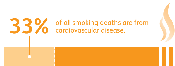
Source: U.S. Department of Health and Human Services. How Tobacco Smoke Causes Disease: The Biology and Behavioral Basis for Smoking-Attributable Disease, A Report of the Surgeon General . Atlanta, GA: Centers for Disease Control and Prevention, National Center for Chronic Disease Prevention and Health Promotion, Office on Smoking and Health, 2010. Retrieved from http://whyquit.com/CDC/SGR_2010_How_Tobacco_Smoke_Causes_Disease.pdf