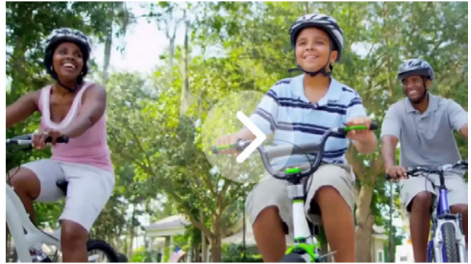
“OWNING Quality” video on how quality fosters trust and ensures patient safety