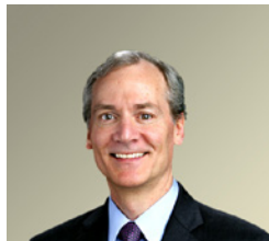
Marc Tessier-Lavigne, Ph.D. President Rockefeller University (4,5)