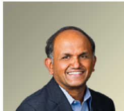
Shantanu Narayen President and CEO Adobe Systems Inc. (3,5)