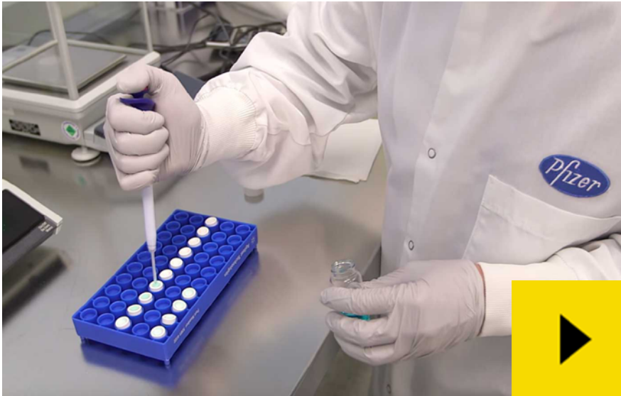
Pfizer Partnering: Bringing Therapies to Patients Faster