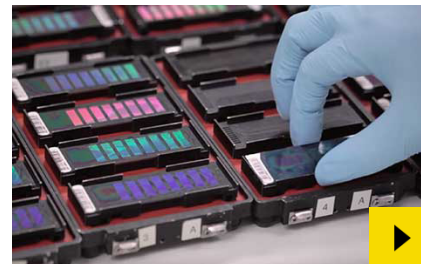
Pfizer Partnerships: Technology

Our collaboration with 23andMe, Inc., a leading personal genetics company, enables us to study demographic and phenotypic data from nearly a million genotyped, de-identified individuals who have consented to participate in genetic research. Through this robust collaboration, we have been able to explore the links between genetic variation and disease phenotypes to identify new targets of potential therapeutic value. We believe this approach has strong potential for the future of drug discovery. In 2014, 23andMe and Pfizer combined forces to enroll 10,000 people with inflammatory bowel disease in a research initiative designed to explore the genetic factors associated with the onset, progression and severity of the disease, as well as response to treatments. In 2015, in a similar but more expansive effort, we collaborated with 23andMe to create a community for people with lupus, incorporating their medical records, genetic information and disease history to help better understand the etiology of the disease.