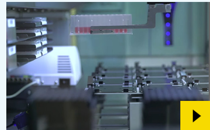
Working Together to Find Cures for Immunological Diseases