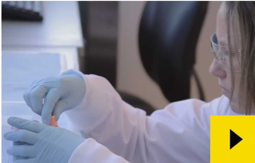
Pfizer Partnerships: Bringing the Best Minds Together

Our Centers for Therapeutic Innovation (CTI) continue to build on an open innovation model for collaborating with academic researchers, foundations and the U.S. National Institutes of Health (NIH). CTI is designed to bridge the gap between early scientific discovery and its translation into new medicines, with Pfizer scientists working side by side with researchers from academia. Currently, CTI has 34 projects ongoing across five therapeutic areas.