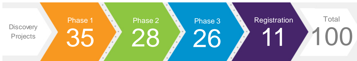
Pfizer Pipeline Snapshot as of January 29, 2019

Pipeline represents progress of R&D programs as of January 29, 2019