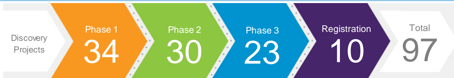
Pfizer Pipeline Snapshot as of April 30, 2019

Pipeline represents progress of R&D programs as of April 30, 2019